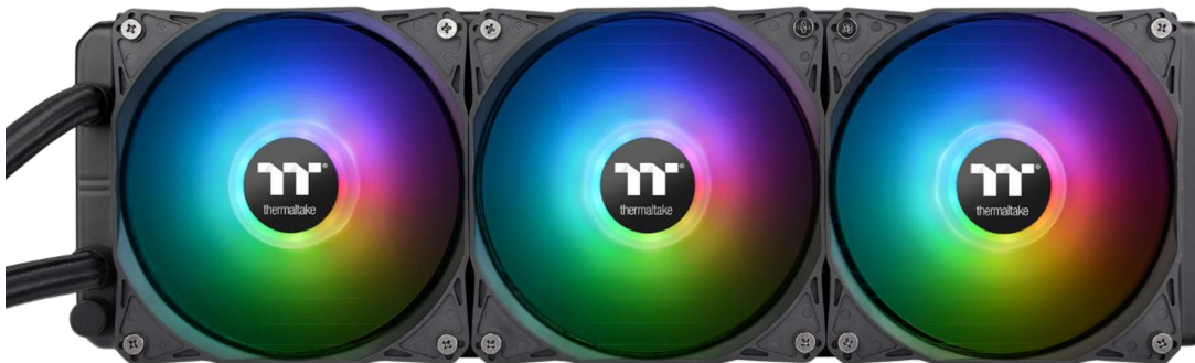
Powerful Cooling Fan