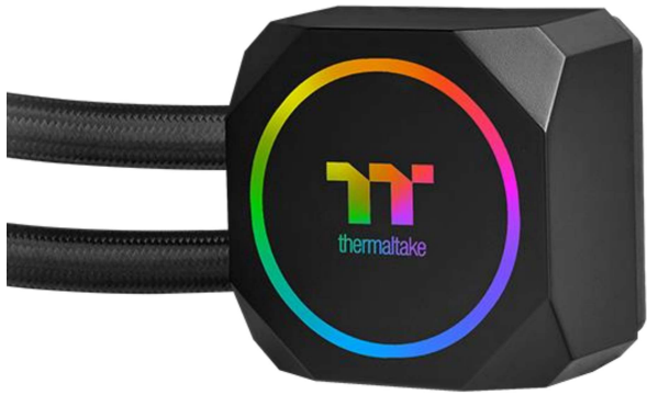
Special LED Water Block Design